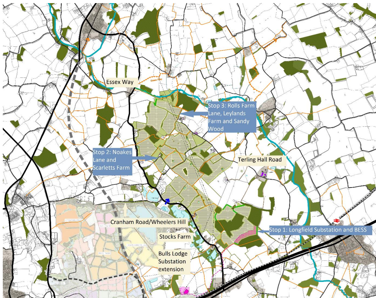
Figure 2 – route map

There are a number of additional locations which we feel are worth considering for site inspections. As these are publicly accessible, we have not included them in the itinerary for the Accompanied Site Inspection. These are shown in Figure 2 in the beige boxes.